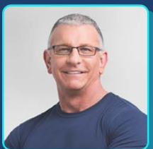
Robert Irvine Celebrity Chef