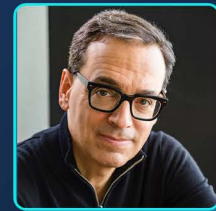
Daniel Pink Best-selling Author