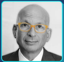
Seth Godin Best-selling Author