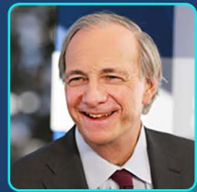
Ray Dalio Billionaire Investor