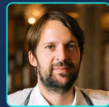
René Redzepi World's #1 Chef