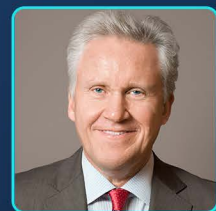
Jeff Immelt CEO of GE