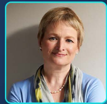
Rita McGrath World's #1 Strategy Thinker