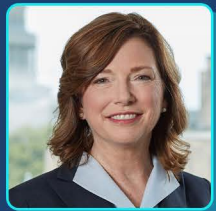
Babara Humpton CEO of Siemens U.S.