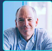
Marc Randolph First CEO of Netflix