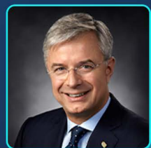
Hubert Joly CEO of Best Buy