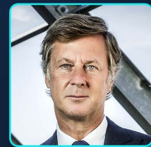
Sébastien Bazin CEO of Accor Hotels