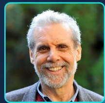
Daniel Goleman Best-selling Author