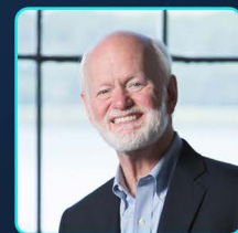
Marshall Goldsmith World's #1 Executive Coach