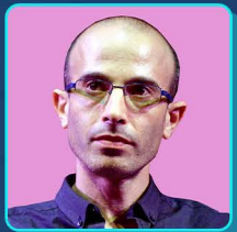
Yuval Harari Best-selling Author