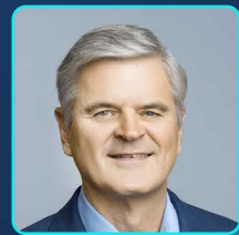
Steve Case Founder of AOL