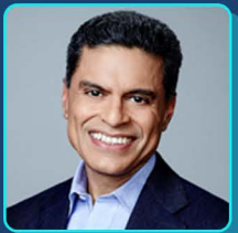
Fareed Zakaria CNN Anchor